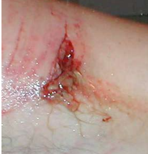
A wound from a dog bite that resulted from breaking up a dog fight

written on my web site concerning wolf-hybrids being kid killers.