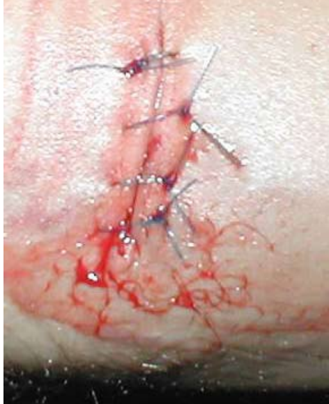
The same wound after being stitched up.